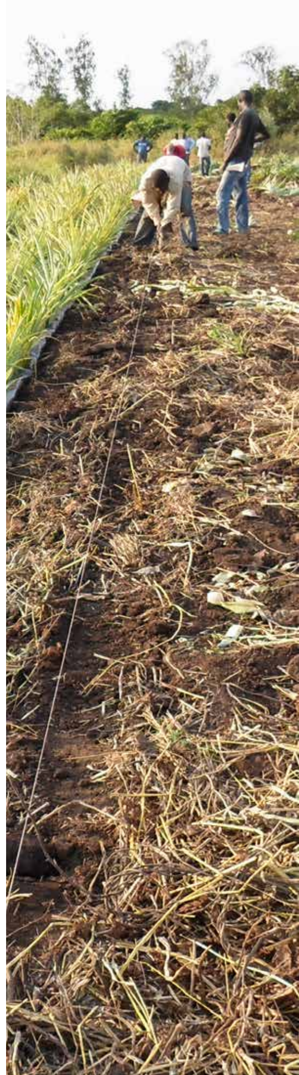
Marking a row to plant organic pineapples